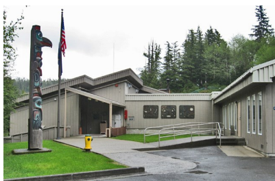
Ketchikan Correctional Center